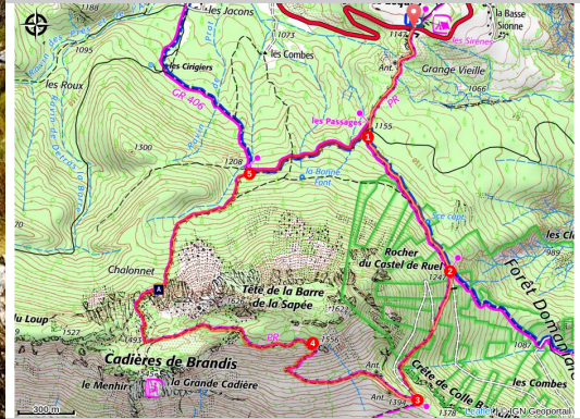
Les Cadières de Brandis

This dolomitic formation is intriguing, it resembles perched chimneys on a ridge with stunning views.