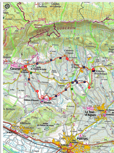
Pause devant l'étang de la Bonde

Or how to, from your bike, ferret around the farmlands, enjoy local produce and discover the know-how