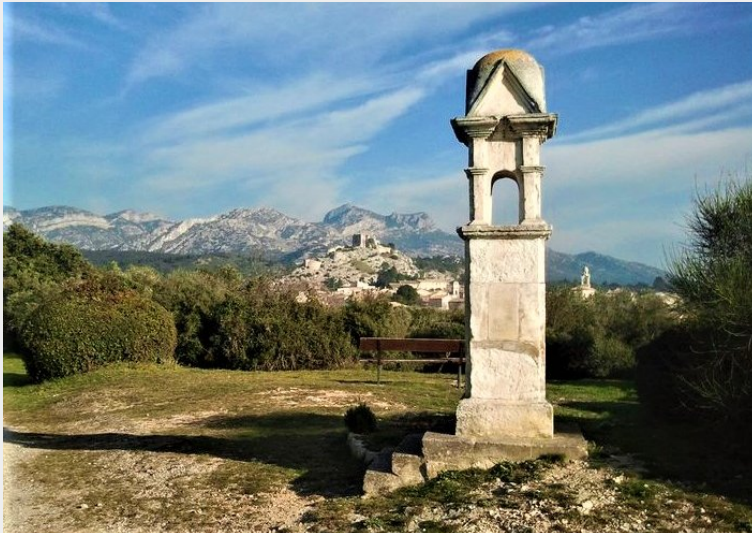
Oratoire (Marianne Dispa - PNR Alpilles)