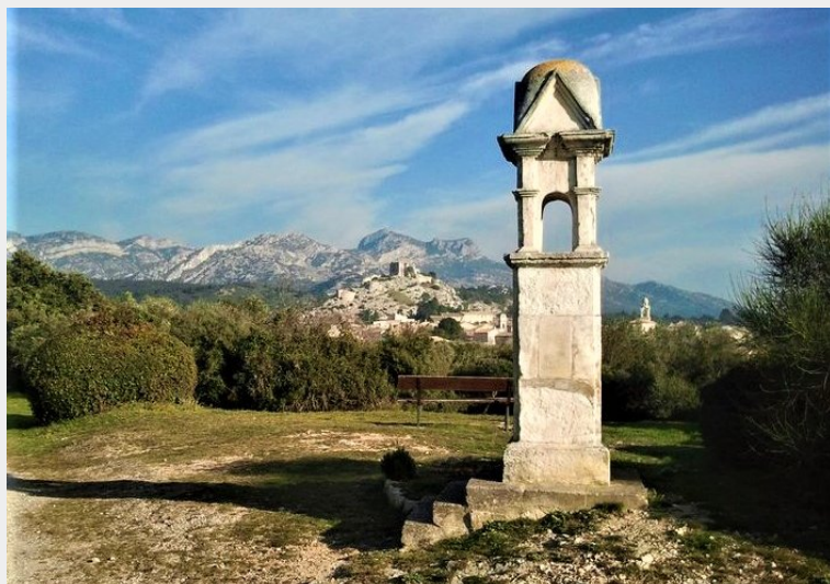
Oratoire (Marianne Dispa - PNR Alpilles)