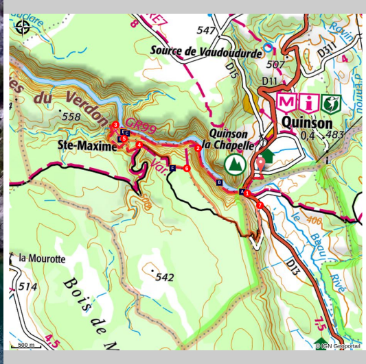
Automne dans les basses gorges

On the old path of the Garde-Canal, you will enjoy the privilege of entering the lower gorges to reach the Sainte Maxime chapel.