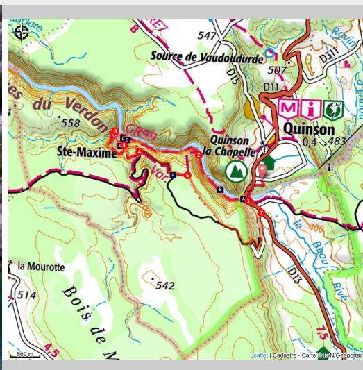
Automne dans les basses gorges

On the old path of the Garde-Canal, you will enjoy the privilege of entering the lower gorges to reach the Sainte Maxime chapel.